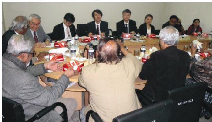
Meeting of SCA Team and BAS Council Members