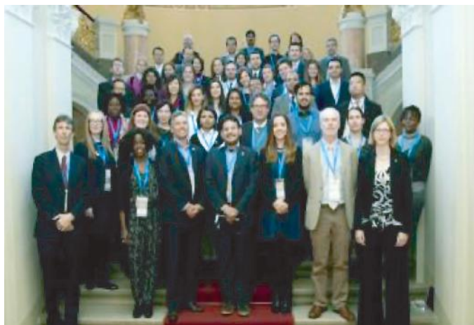
Young scientists participating "Scoping the Future".

Prior to the opening ceremony on 4 November, 2015 over 50 young researchers from 30 different countries convened by IAP, WAYS, ICORSA, GYA and UNESCO gathered to analyze challenges and opportunities facing young scientists globally, identifying strategies that link global challenges to career opportunities and present policy recommendations to empower young scientists to impact the 2030 Sustainable Development Goals (SDGs). The four organizations representing young scientists around the world came together for the first time to present a unified voice for the emerging international young scientist's movement, which is demanding a seat at the table in policy discussions and decision making that require scientific input.