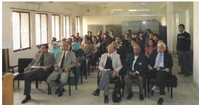
Participants attending the lecture