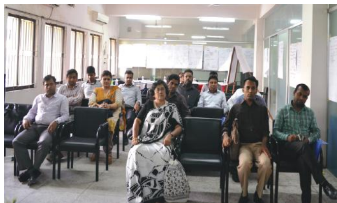
Participants of BanglaJOL Training Workshop